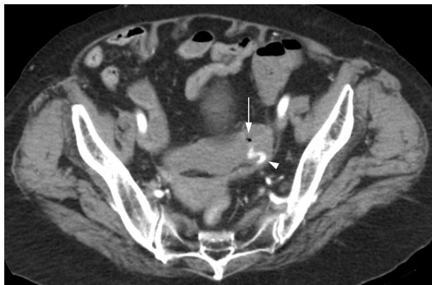
Fig. 1. The abdominal computed tomography image showing an air bubble (arrow) and an extravasation of contrast (arrowhead) in the sigmoid colon.

(NBI) (Fig. 3) revealed a hemorrhagic lesion. What is the most likely diagnosis?