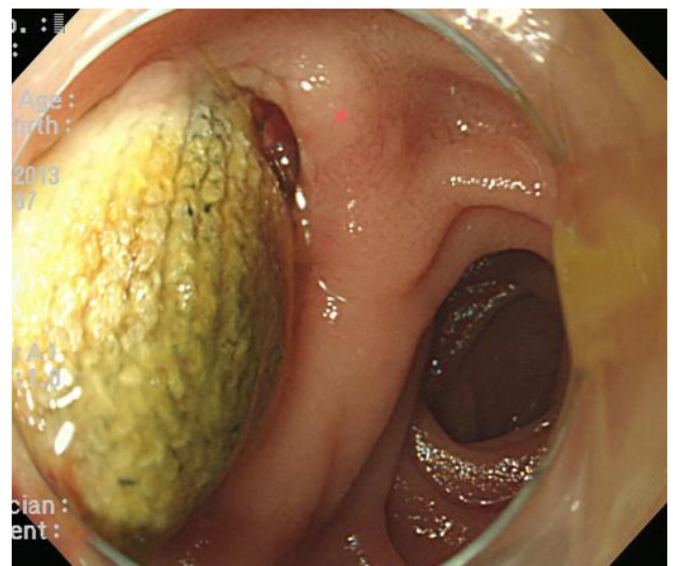
Fig. 1. Upper gastrointestinal endoscopy reveals a foreign material (an aortic stent graft) and blood clot with vascular pulsation (asterisk) in the third part of the duodenum.

tion procedures 1 and can develop anywhere in the gastrointestinal tract adjacent to the aorta; however, it is most frequently observed in the third part of the duodenum, which is anchored in the retroperitoneal space and positioned directly anterior to the aorta. The location of the duodenum in close proximity to the aorta makes it susceptible to fistula formation due to the constant transmission of pulsatile forces from the aorta. 2 Therefore, aortoduodenal fistula should be considered a potential cause of hematemesis or hematochezia in patients with a history of aortic stent graft. 3